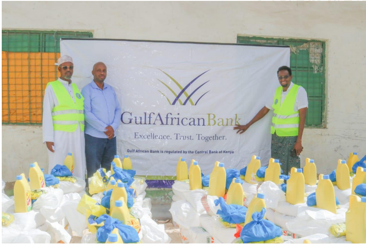
Ramadhan Donation efforts in Garissa Town presented by Garissa Branch Team