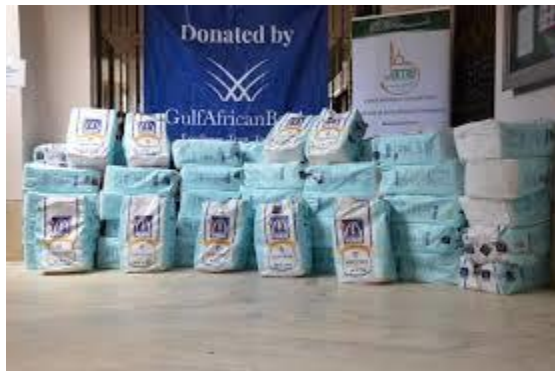
Ramadhan donation in Nairobi's Jamia Mosque aimed at assisting the needy in the larger county area