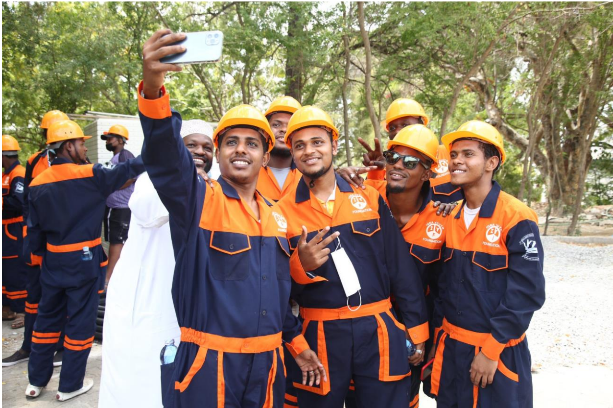
Iqra Youth Foundation trainees who gained access to various skills in electrical and mechanical work.

The Foundation also donated to the Iqra Youth Foundation which provides vocational and technical training to at risk youth in Mombasa. The Foundation sponsored 50 students who were able to complete various training course from plumbing to electrical work. This effort saw the youth gain skills that would gain them financial independence and deter them from drugs and rising cases of gang violence in the County of Mombasa.