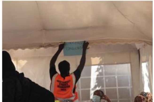
Images from the various medical and surgical camps carried out in Lamu and Makindu area