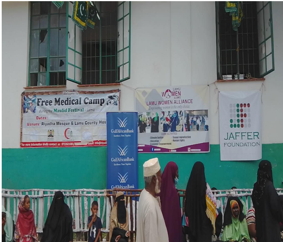
Lamu Medical Camp by Masjid Riyadhha Group, 2021