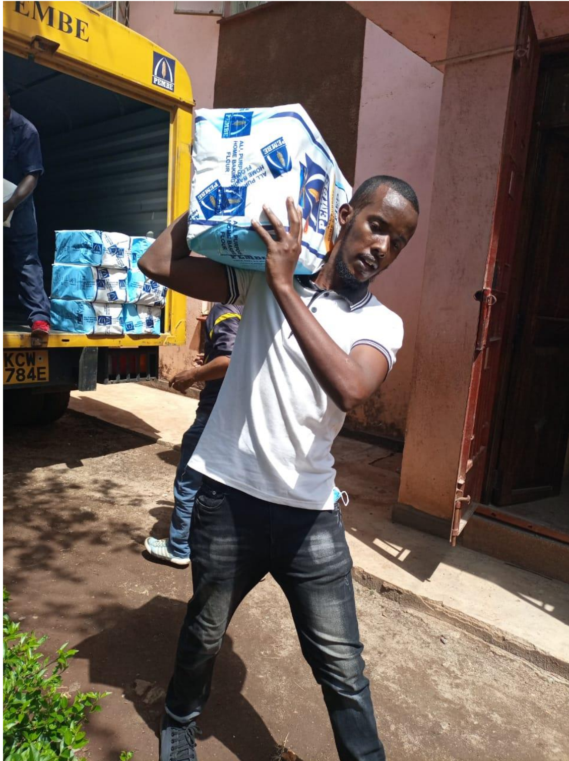
Offloading of maize flour to Rekindle Hope Islamic Organization in Thika, Kiambu County, 2021